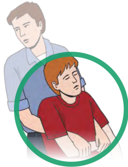
Rescue person out of the hazard zone if necessary